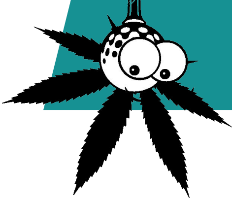
Photo Booth Sponsor